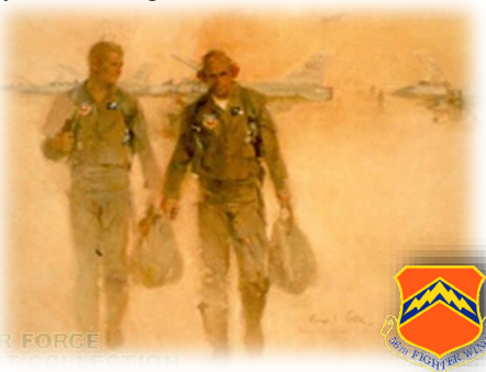
Below: Two pilots leave the flightline with F-16 “Fighting Falcon” jets at MacDill. The base was home to fighter aircraft from 1962 up to 1993.