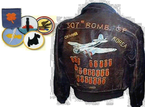
Above: Unit patches and a bomber jacket from the 307th Bombardment Group at MacDill in the early 1950s.

In 1963, the bombers gave way to the fighters when MacDill became a Tactical Air Command training base. Throughout the Vietnam War and up until the first Gulf War in 1991, Tampa became a home for the F-4 “Phantoms” and later the F-16 “Fighting Falcons.” Between 1979 and 1993 approximately half of all F-16 pilots trained at MacDill.