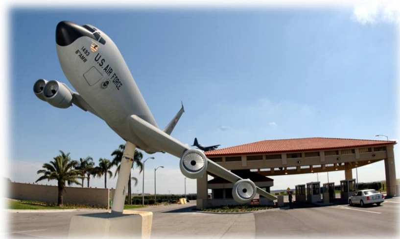
Left: A jumpmaster of U.S. Special Operations Command (at MacDill) directs parajumpers aboard a C-130 "Hercules." Right: A model of the KC-135 "Stratotanker" greets visitors at the front gate of MacDill Air Force Base.

In 2008, the base wing experienced more changes as part of a major restructuring by the Air Force. This time, MacDill and the 6th welcomed the Air Force Reserve's 927th Air Refueling Wing as a joint partner in the aerial refueling mission at MacDill. Currently, these two units – one active duty and the other reserve – work together using the same KC-135 "Stratotankers" to more efficiently carry out the Air Force's missions. Today at MacDill, the 6 th Air Mobility Wing performs aerial refueling, airlift, and contingency response missions for U.S. and allied forces around the world. The wing has sixteen KC-135 "Stratotankers," three C-37A aircraft, and more than 2,700 personnel assigned. Additionally, the 6th Air Mobility Wing is the host unit of MacDill Air Force Base and provides direct support to U.S. Central Command, U.S. Special Operations Command, and 39 other tenant units.