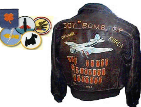
Above: Unit patches and a bomber jacket from the 307th Bombardment Group at MacDill in the early 1950s.

In 1963, the bombers gave way to the fighters when MacDill became a Tactical Air Command training base. Throughout the Vietnam War and up until the first Gulf War in 1991, Tampa became a home for the F-4 “Phantoms” and later the F-16 “Fighting Falcons.” Between 1979 and 1993 approximately half of all F-16 pilots trained at MacDill.