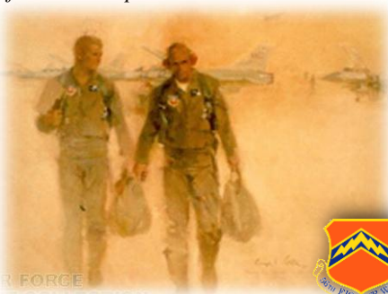
Below: Two pilots leave the flightline with F-16 “Fighting Falcon” jets at MacDill. The base was home to fighter aircraft from 1962 up to 1993.